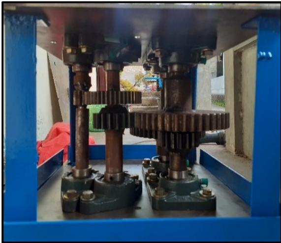
Figure 1. Gear Box Assembly and Arrangement